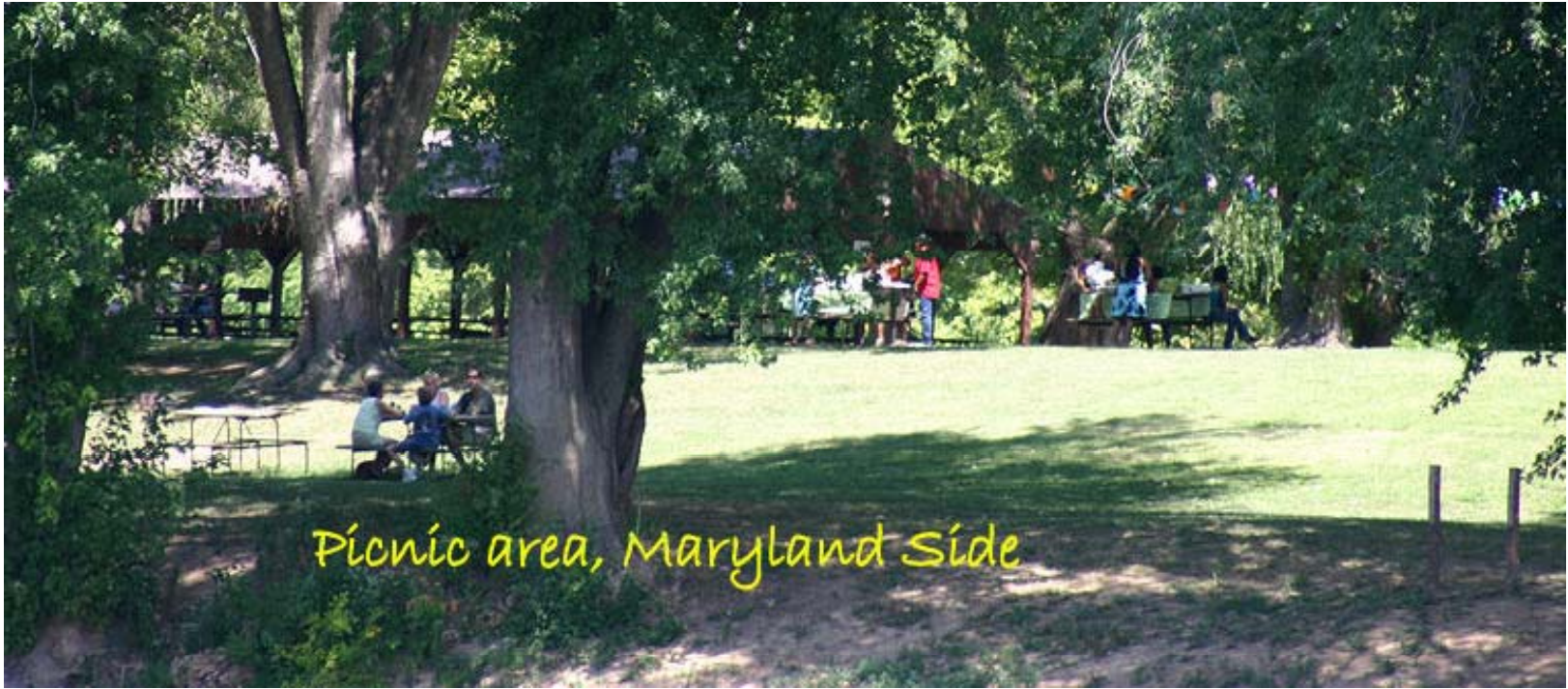
Picnic area, Maryland Side