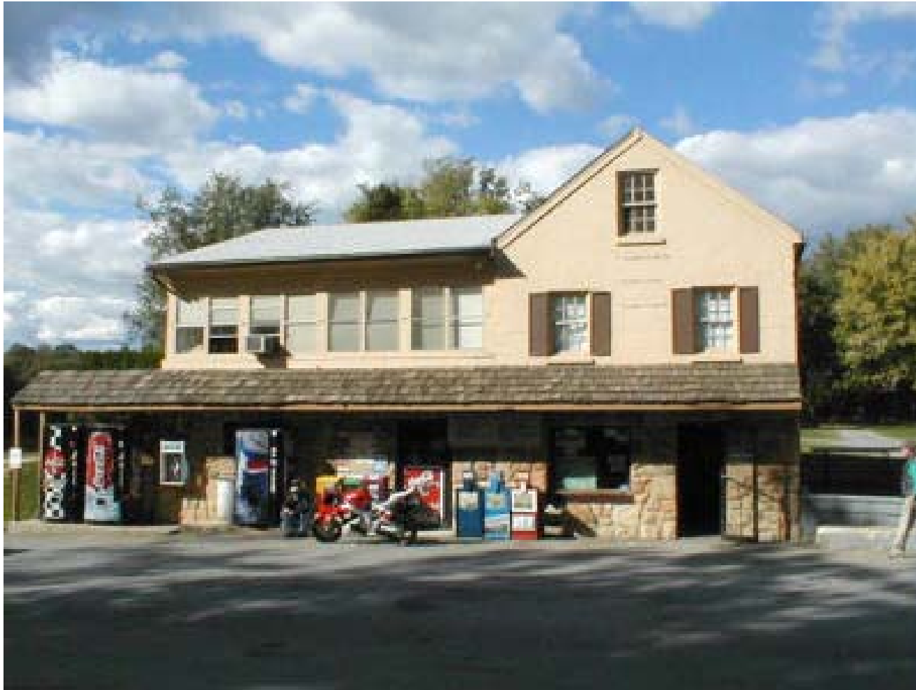
Whites Ferry Deli Store : Sandwiches, Soft drinks, Snacks, Fruits.