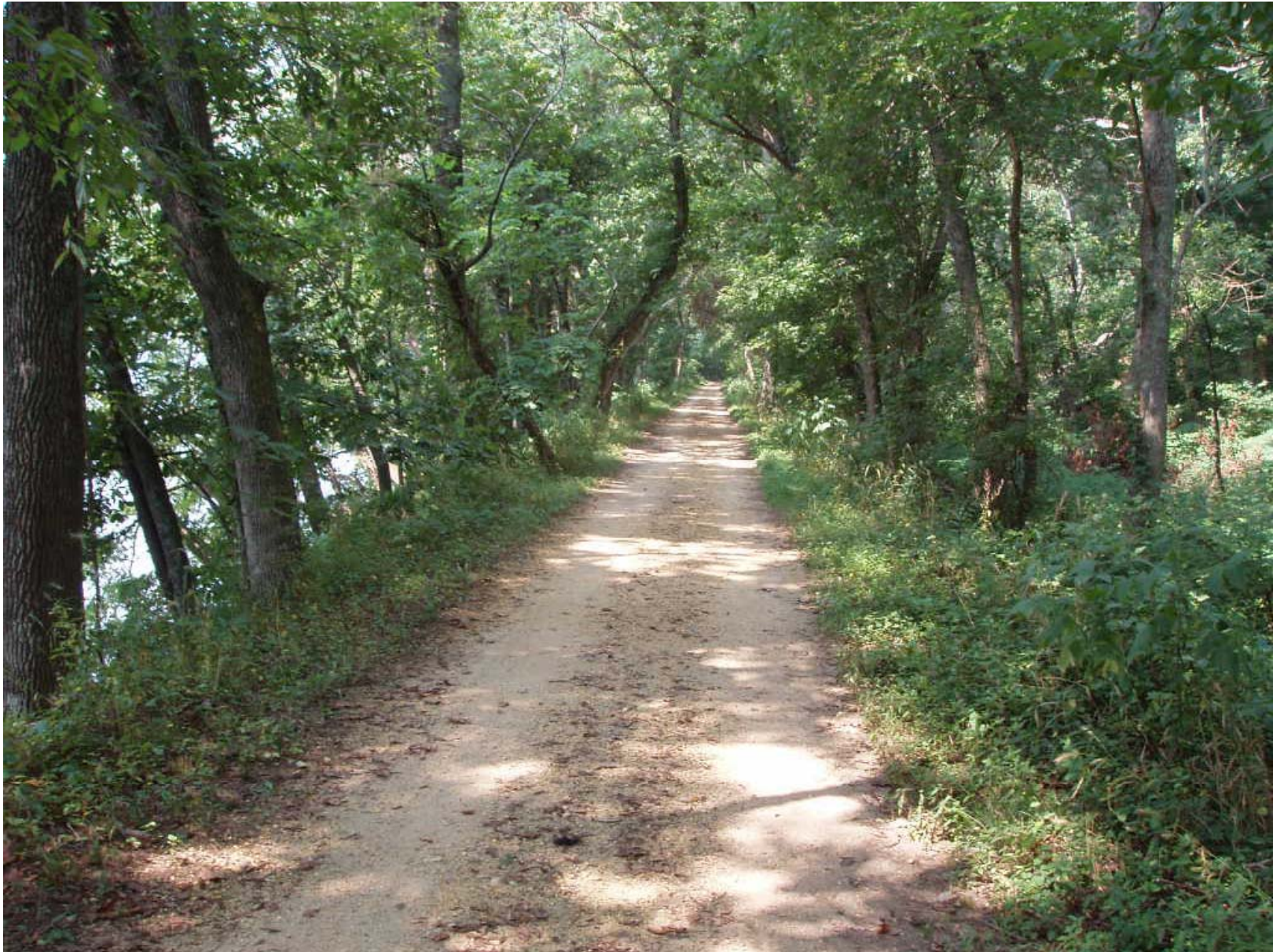
Peaceful trail on the C&O towpath. More than 80% of trail is shaded area. Very cool!