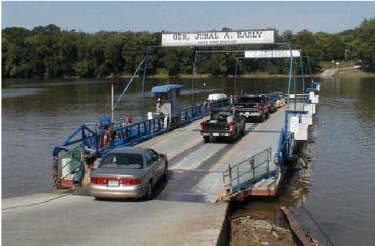
The Whites Ferry is the only Ferry in the Potomac river.